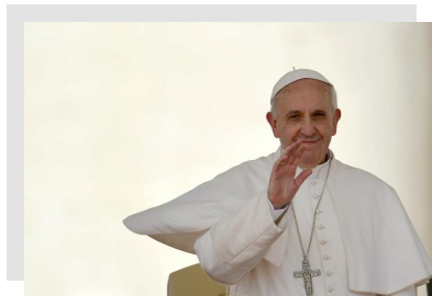
Pope Francis

Humble, modest, giving, courageous, and merciful are all words that fit when describing Pope Francis. He takes on a whole new view on what the job of the Pope is. Pope Francis started from the very beginning by shocking the world and reminding us Catholics who we are called to be and how to be it. He does some of that through the words he speaks, but the larger impact he makes is by actually doing. We see him go out into the streets and be with the sick, the poor, and those who are typically shunned from society. We see him talk about subjects we normally shy away from: same-sex marriage, families, divorce, and contraceptives. Especially in this day and age, we need to be able to understand and then stand up and